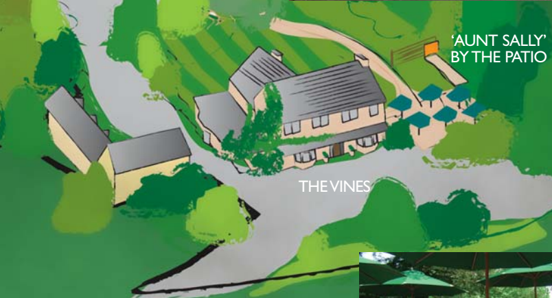
'AUNT SALLY' BY THE PATIO