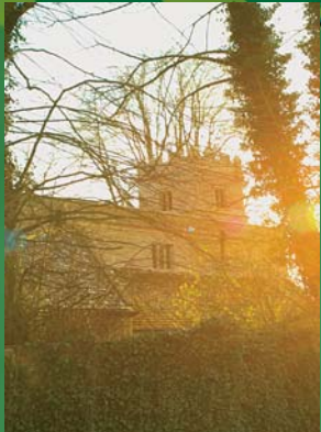
Black Bourton church